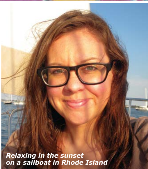
Relaxing in the sunset on a sailboat in Rhode Island